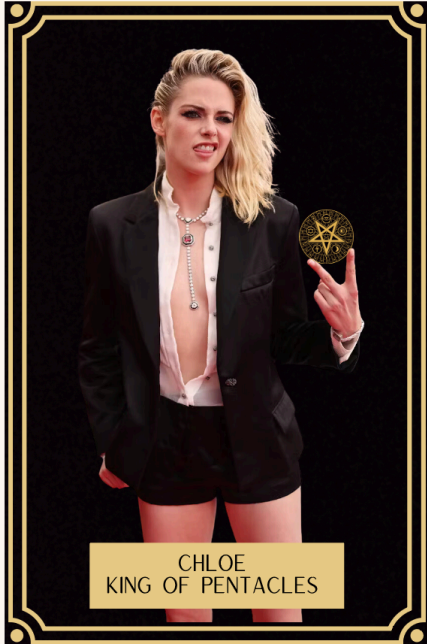
CHLOE KING OF PENTACLES