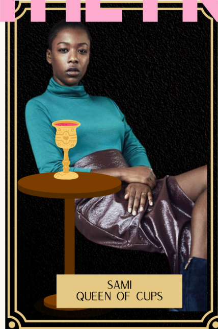
SAMI QUEEN OF CUPS